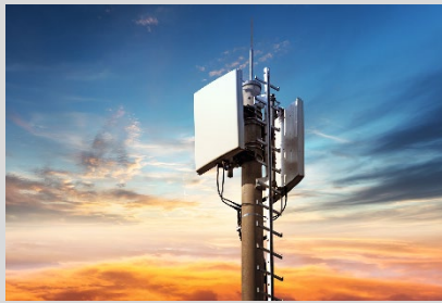
Telecomm., Optical Fibre, Coaxial